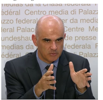
Federal Councilor Berset explaining the new measures on Sept 24th.

Non-vaccinated travelers are no longer authorized to enter the Schengen area when coming from Japan (or if they have been in Japan during the last two weeks e.g. in transit). A few exceptions exist, however, for family or business purposes. But tourism is currently not possi-