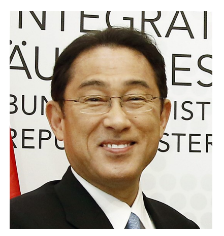
Fumio Kishida during his last visit in Europe in 2017 as foreign minister.

helpful in this regard. The new PM will also have to lead the party to the coming general elections in November. Indeed, the LDP wants to secure its majority. Readers of the <u>NZZ</u> and <u>LeTemps</u> can read about it in their respective languages. Japanese media are extensively covering the news. For news in English we recommend <u>Nikkei Asia</u> or JapanTimes.